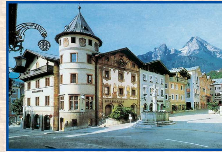
Walk Through Berchtesgaden