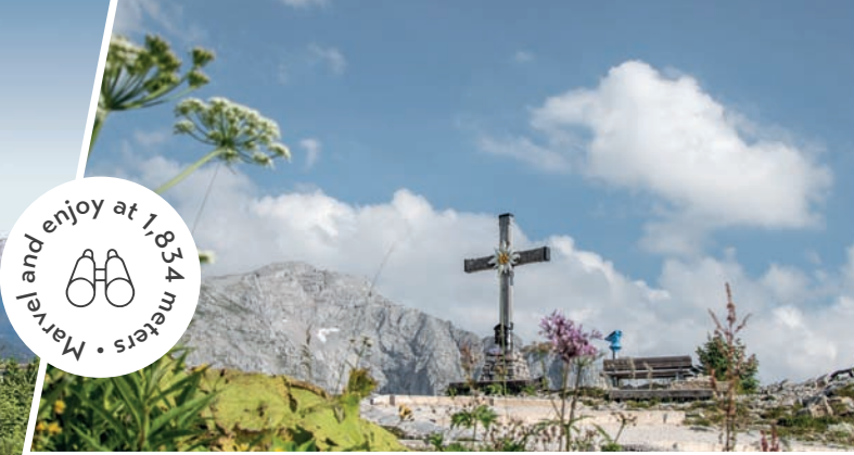
The summit cross can be reached in five minutes from the Kehlsteinhaus.