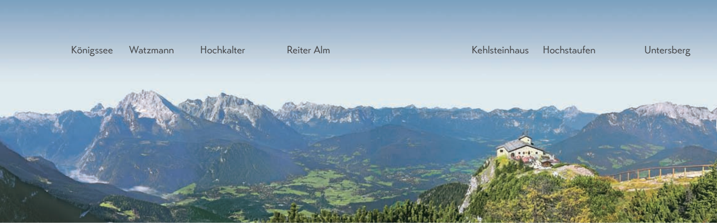
Panoramic view from the Kehlstein

The Eagle's Nest is located above Berchtesgaden at an elevation of 1,834 meters above sea level. Its history is inseparably linked to that of the Obersalzberg. Between 1933 and 1945, it was the second most important center of power of the Nazi dictatorship, after Berlin, where decisions were made about persecution, war, and genocide.